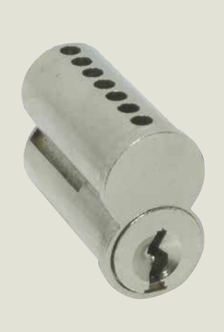
7CS Series Cores